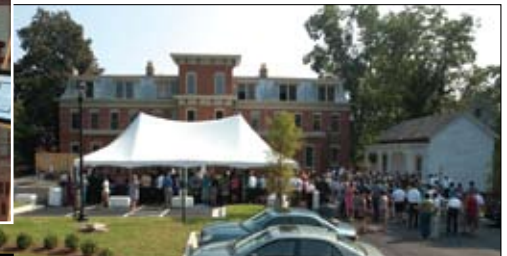
More than 250 friends attended the dedication