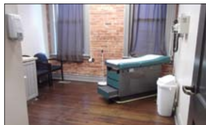
One of the new exam rooms