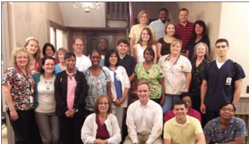
The CCHSA Staff - ready to serve