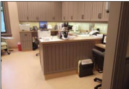
The New Lab

Sources: Georgia Health Sciences University, Historic Augusta, Inc., University Health Care System.