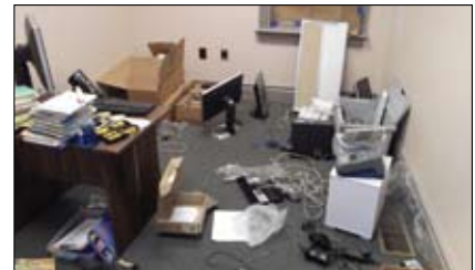
IT Central during set-up at the Widows Home