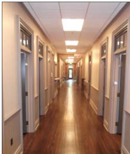
Ready for the patients